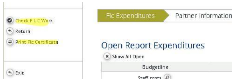
Fig.14 Printing the FC Certificate and Checking FC work

You can see the pdf of the FC certificate, which also includes all questions of FC checklist after pressing “Check FC work” and then “Finalise FC work”. In order to access these buttons, you must be in the “FC expenditure” tab.