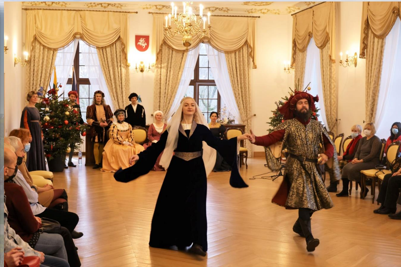
Concert „A Night in Renaissance“