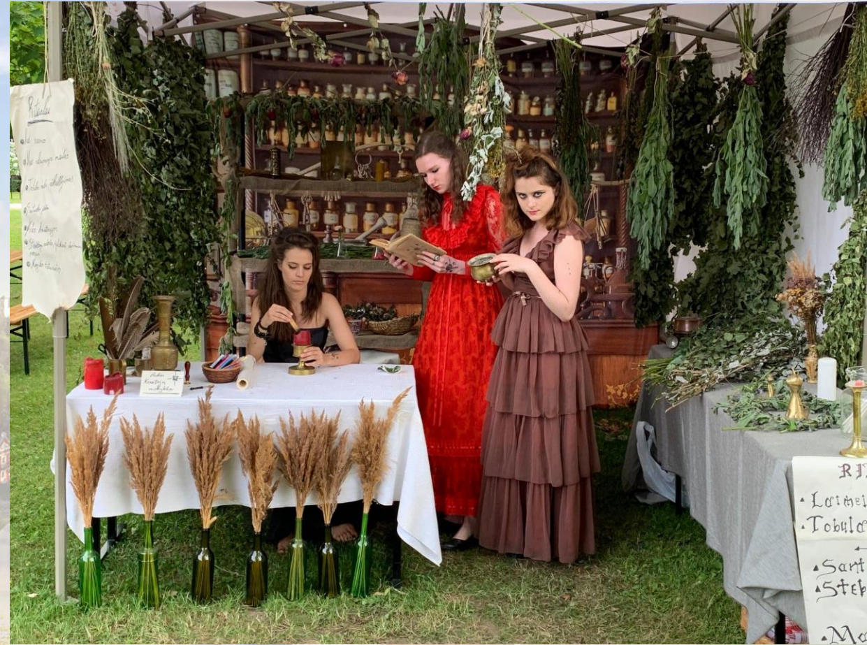
Festival "Castle day": concert performances, crafts and workshops.