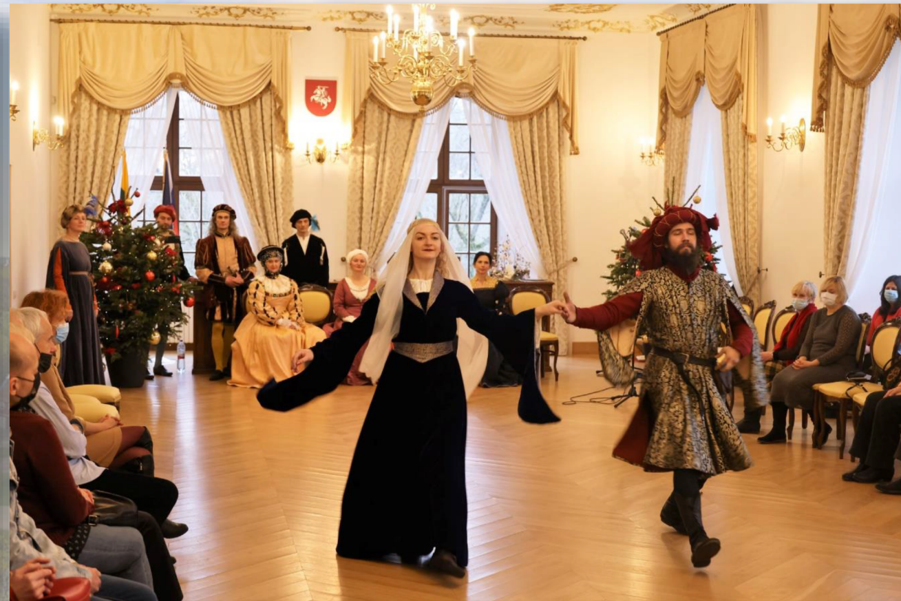
Concert „A Night in Renaissance“