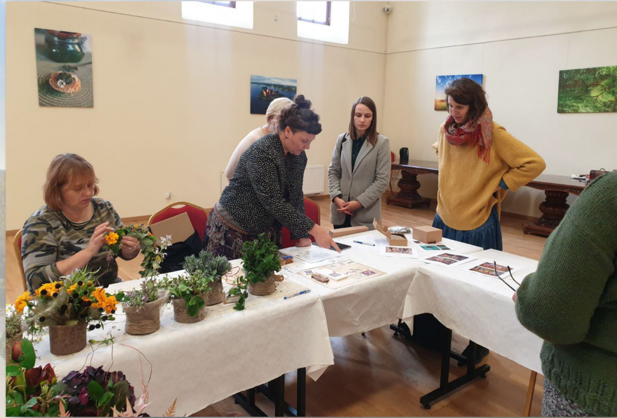
“Baltic treasure” creation process