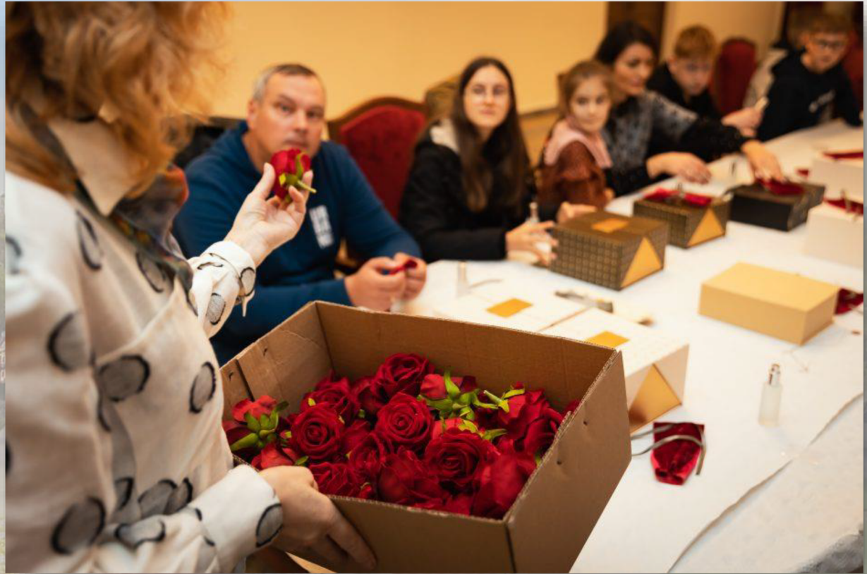
“Baltic treasure” workshop